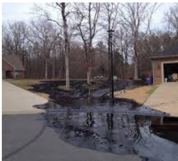
A pipeline spill on March 29, 2013 in Mayflower, Arkansas was an estimated 1 million litres of DilBit.

A decision by the Supreme Court to uphold the right of Canadian cities to pass bylaws to protect residents will change the balance of power in Canada toward more local control. This can pave the way for wider participation in key