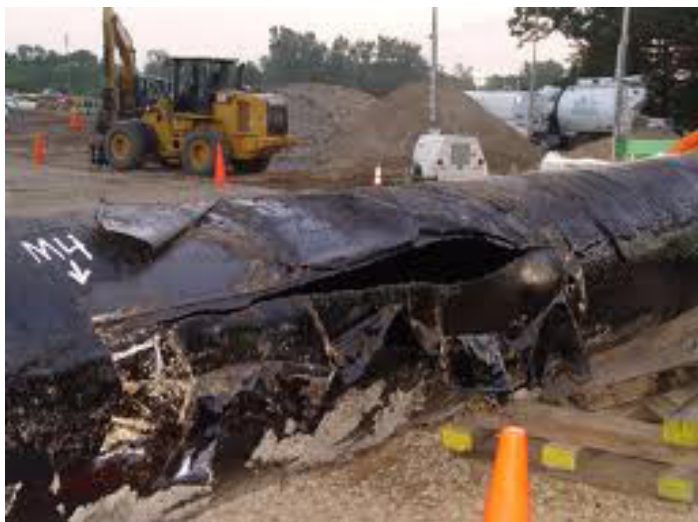
Cleaning up the 2010 pipeline spill in Marshal, Michigan (Kalamazoo) has cost almost $1 billion and is still not finished.

In its October 16, 2013, submission to the National Energy Board (NEB) on Line 9, the City of Toronto cited a Supreme Court precedent ( Spraytech v. Hudson , 2001), "The Supreme Court here refers to the principle of 'subsidiarity' which suggests that local governments, being the closest to the people, should be empowered to exceed not lower national norms" [and cites] "the role of municipalities as 'trustees of the environment'" said City Solicitor Graham Rempe.